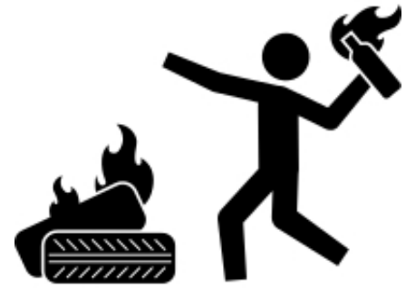
Fig. 1: by Juan Pablo Bravo

Loads is a tool to load test your HTTP services, including web sockets. With Loads , your load tests are classical Python functional tests which are calling the service(s) you want to exercise.